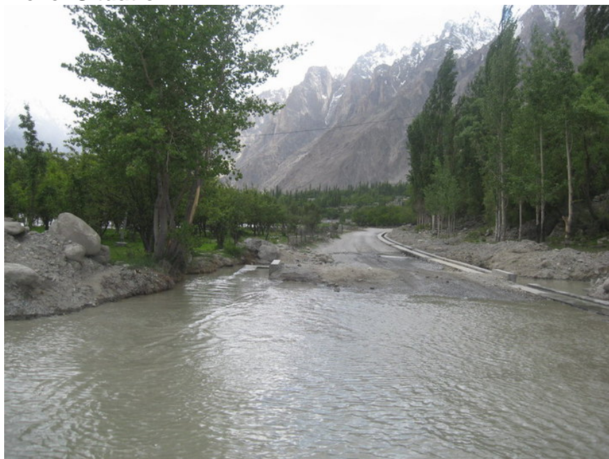
Image 3: A portion of the KKH was submerged in lake water between Gulmit and Ghulkin

A meeting was held at Shishkat with local communities, participated by RC Hunza, and local community members. The meeting discussed possibilities of construction of shelters for the IDPs of Shishkat and Ayeenabad.