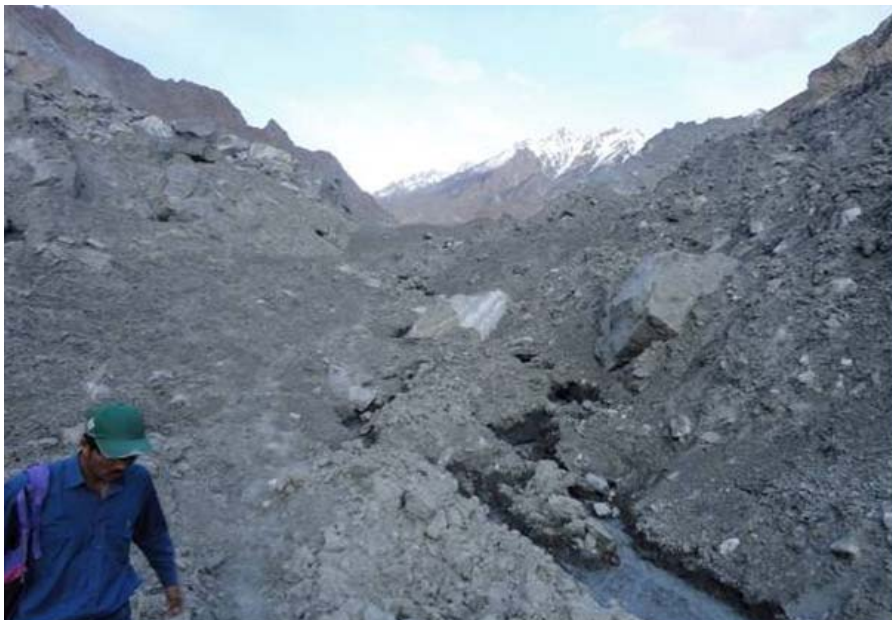
Image 1: A new seepage has developed at toe of the spillway, discharging 8.5 Cusecs of water as of May 13

Water Inflow in the Hunza River has increased to 2500 Cusecs , taking the average daily water rise to 3.33ft . Freeboard has decreased to 33.39 ft . If water level keeps rising at the same rate it is possible for the lake to overtop by May 22 – 30. Depth of the lake has increased to 329 ft . Extended length of the lake is around 17 kilometers and advancing fast towards village Hussaini.