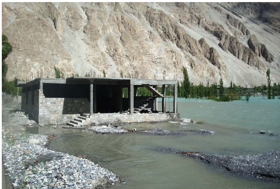
Image 2: An under construction house getting submerged in the lake water in Shishkat Payeen

The local people are evacuating shops, hotels and houses, shifting their belongings and families to safer locations.