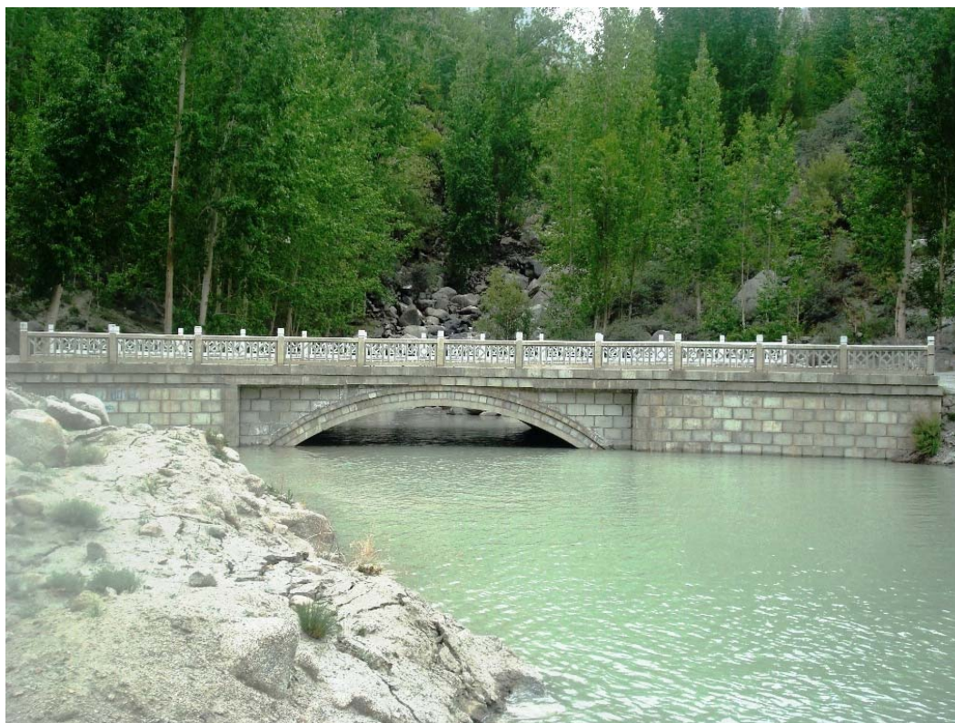
Image 4: Critical infrastructure has been destroyed across Hunza Valley already

Boat services remained operational in the upstream areas during the reporting period, hindered at time by rains and wind.